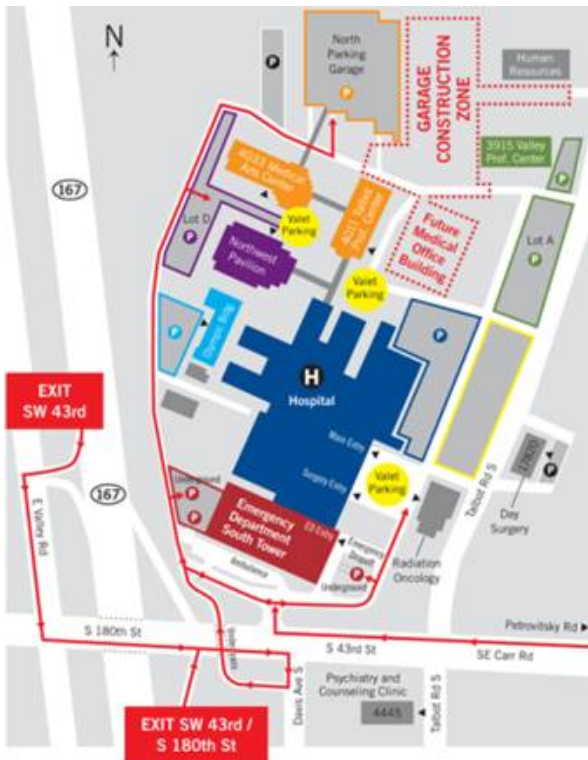
Area map for Valley Medical Center