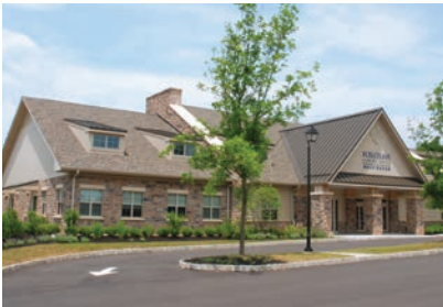
Fox Chase Cancer Center – Buckingham 2365 Heritage Center Dr Furlong, PA 18925 888-369-2427

This includes both benign urology and oncologic urology.