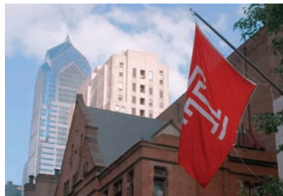
Temple Health Center City 255 S. 17th Street Medical Tower, 7th Floor Philadelphia, PA 19103 800-TEMPLE-MED