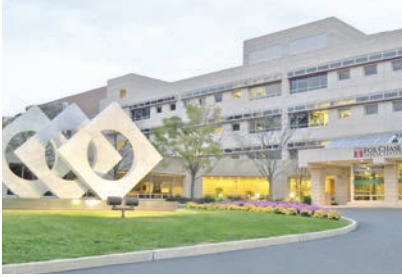
Fox Chase Cancer Center 333 Cottman Avenue Philadelphia, PA 19111 888-369-2427