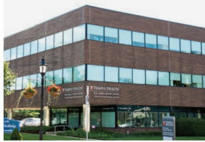
Fox Chase Cancer Center – Huntingdon Pike 8 Huntingdon Pike Rockledge, PA 19046 888-369-2427