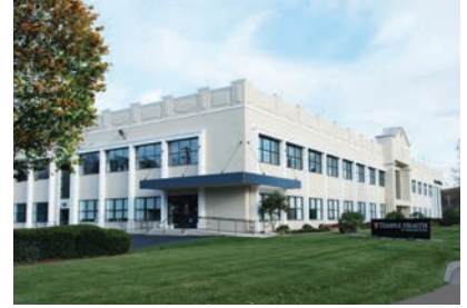
Temple Health Ft. Washington 515 Pennsylvania Avenue Fort Washington, PA 19034 800-TEMPLE-MED

This includes both benign urology and oncologic urology.