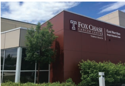
Fox Chase Cancer Center – East Norriton 2701 Dekalb Pike Norristown, PA 19401 888-369-2427