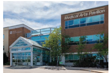
Temple Urology at Suburban Hospital 2705 Dekalb Pike Medical Arts Pavilion, Suite 310 East Norriton, PA 19401 215-728-2941