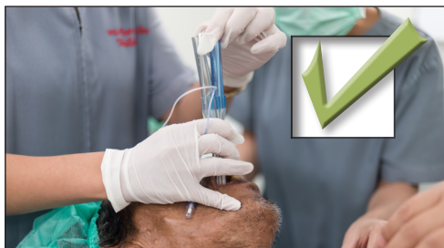
Double-lumen and Bronchial blocker tube placement